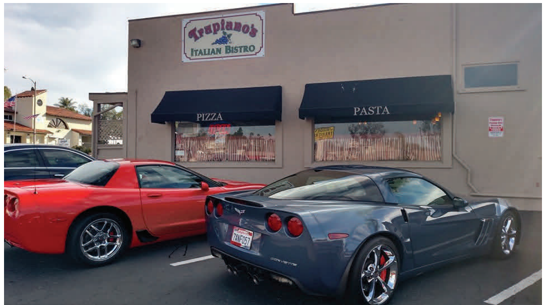
Parking at Trupiano's