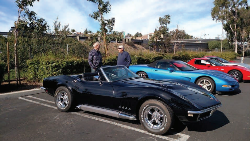
Meeting up at North County Fair