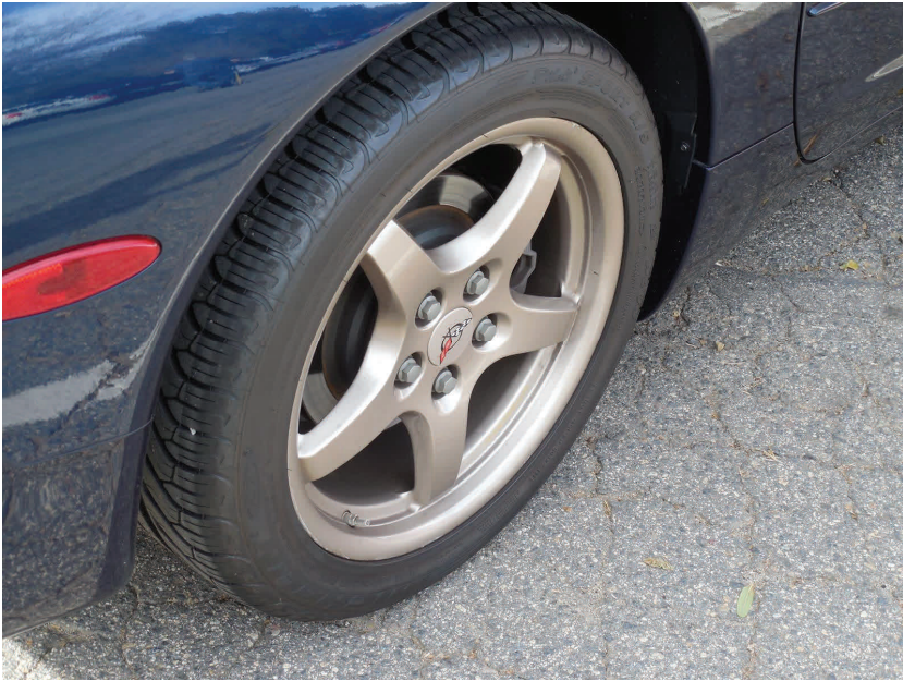
A true Mag wheel!