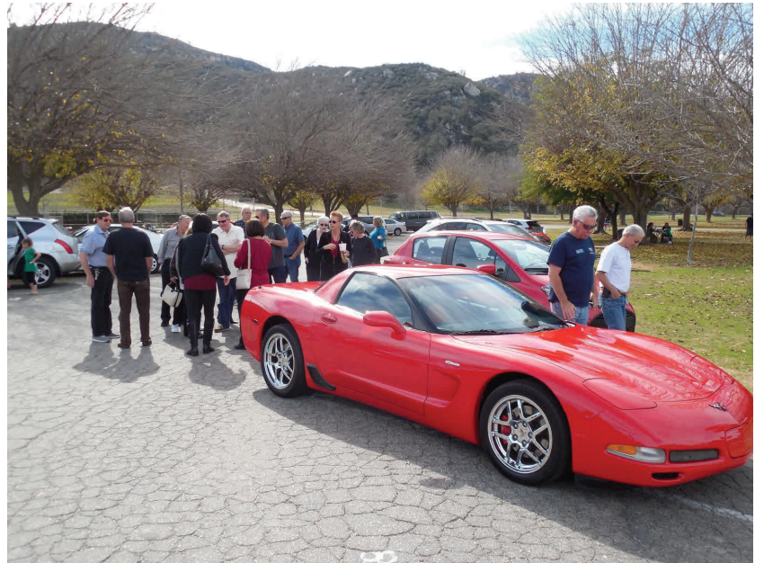
Parking at Bates Nut Farm